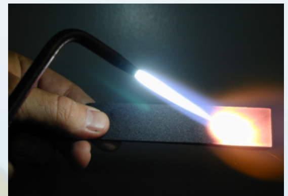
CARBON FOAM TPS WITH ACETYLENE TORCH