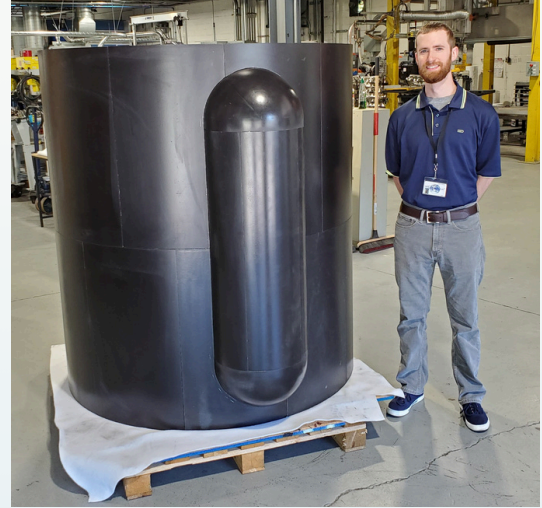
MANUFACTURING DEMO ARTICLE 54-INCH (1.4-METER) DIAMETER, 60-INCH (1.5-METER) HEIGHT

Touchstone's thermal and lightning protection system, Faraday, provides a distinct approach to shielding technologies. As a composite system, it can be easily optimized for unique applications to provide protection from a variety of threats – including thermal, lighting, and radiation. Faraday uses materials that are both thermally and environmentally stable, ensuring robust shelf-life and reliability upon deployment.